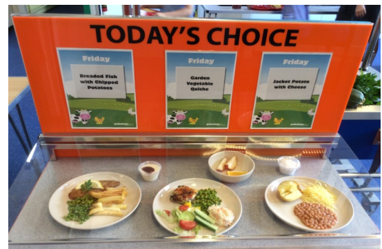
What's for lunch today?

However, children leaving means new members of our family arriving and we would like to extend a warm welcome to everyone who has joined us and we hope your experience at Howard will be a memorable one. Please make our new parents and children welcome.